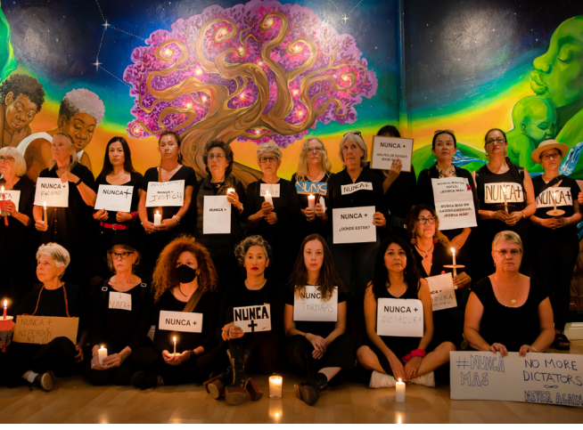
Left: September 11th, 1973 Memorial (2023). Right: Collective Women-led Action "NUNCA + (dictadura)" (2023)