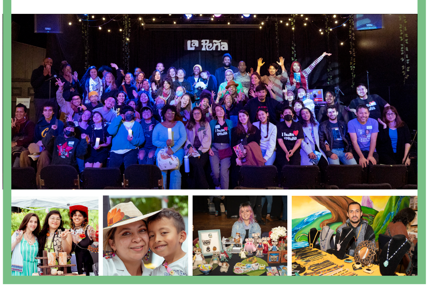
Top: Empowering People of Color Open Mic (Oct, 2023). Bottom: Summer Tianguis & Holiday Mercado (2023).

At La Peña we recognize that in order to create strong, free, and thriving communities, we need to create paths for creativity to be encouraged and properly developed. Our Empowering People of Color Open Mic series, along with our Yearly Art Exhibition, our Summer Tianguis, Holiday Mercado, and Artist Directory are ways by which we celebrate and support emerging/local artists through a lens of equity and inclusivity.