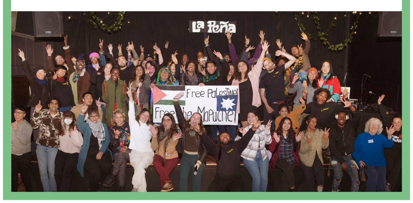
Group photo at the end of our Empowering People of Color Open Mic (December, 2023).

At La Peña, we have many pathways for our community to contribute to our mission and be part of our efforts to create a more equitable, creative, and exciting future for everyone. Check them out below & see you soon!