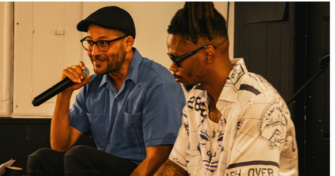
Left: Casa Borinqueña Fundraiser (2023). Right: Fist Up Film Festival, Opening Night of Short Films (2023).